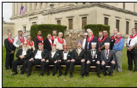
2007 Fall Reunion Class

It was warm and humid outside. But, in the Auditorium and the Lodge Room, all the warmth was generated by brotherly love. The 2007 fall reunion at the Kansas City Valley was a success by all measures. Ten Masons from the Orient of Missouri and four from the Valley of Northeast Kansas became Masters of the Royal Secret Saturday afternoon with the help of approximately 100 volunteers from our Valley. We were honored to have Ill. Bro.